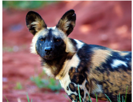
African Painted Dog

Habitats – Overview of the main habitat types in Africa.