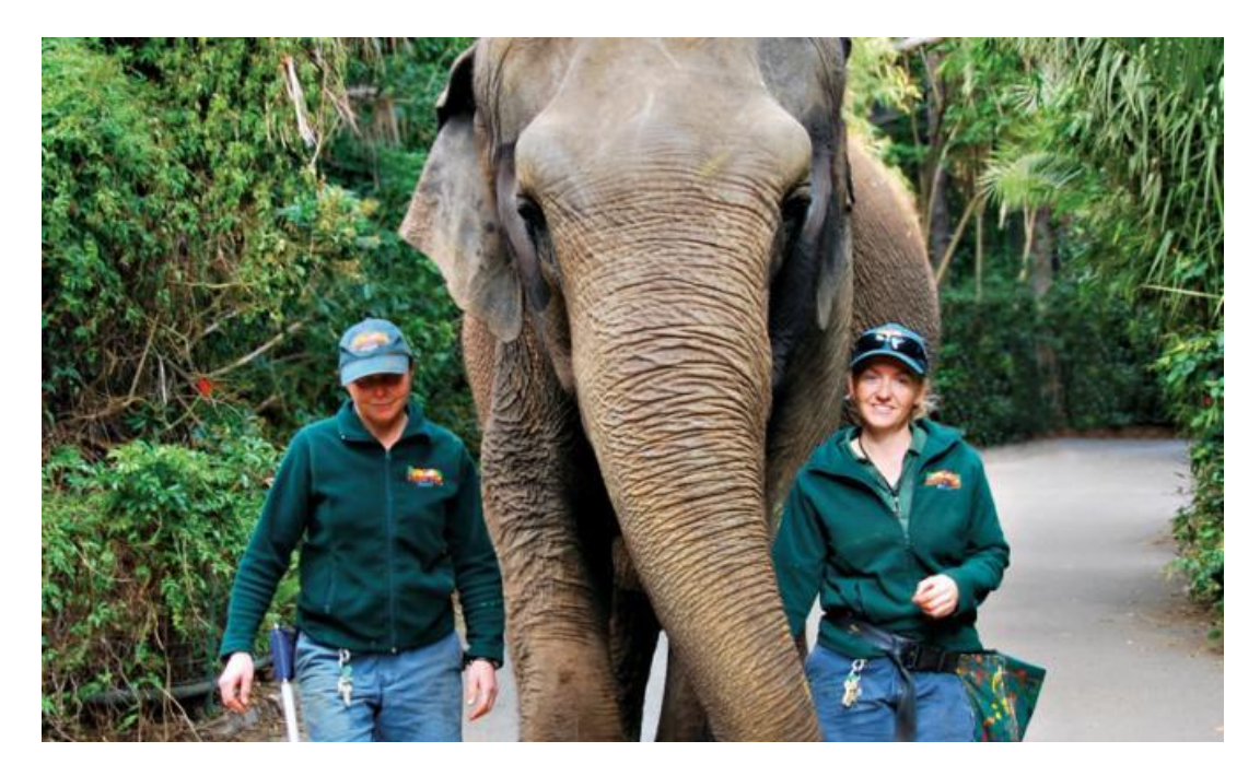
Some animals don't like to be touched, so I can try to remember to ask the Zoo keeper before touching them.