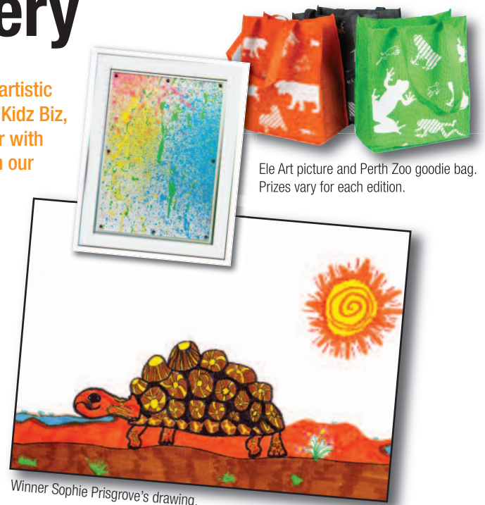
Ele Art picture and Perth Zoo goodie bag. Prizes vary for each edition.

It's time to get drawing. This time the first prize is an Ele Art picture and second and third prizes are a Perth Zoo goodie bag. Send your drawing, either by mail or email, to newspaws@perthzoo.wa.gov.au by 17 April 2015. Include your name, phone number and Numbat Club membership number. Prizes can only be collected from Perth Zoo and will not be posted. Terms and conditions are on our website.