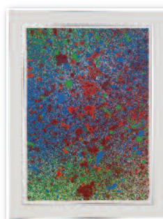
The next winner will receive an Ele Art painting.

Next issue we will feature the Little Penguin and the first prize winner will receive an Ele Art painting. Second prize is a Perth Zoo showbag and third prize is a child's entry ticket to Perth Zoo so you can bring along a friend. Winners will also receive a Perth Zoo lanyard to hold their membership cards. Send your drawing, either by mail or by email to newspaws@perthzoo.wa.gov.au , by 18 October. Include your name, phone number and Numbat Club membership number. Prizes can only be collected from Perth Zoo and will not be posted. Terms and conditions are on our website.