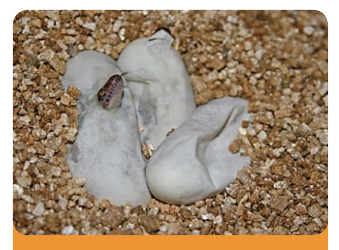
Pygmy Python hatchlings.

Perth Zoo's breeding success with Australian snake species continued following the hatching of 17 Woma Pythons and three Pygmy Pythons. These pythons are two of the 15 endemic species of python in Australia. The Western Australian Woma Python is now classified as endangered. Land clearance and habitat