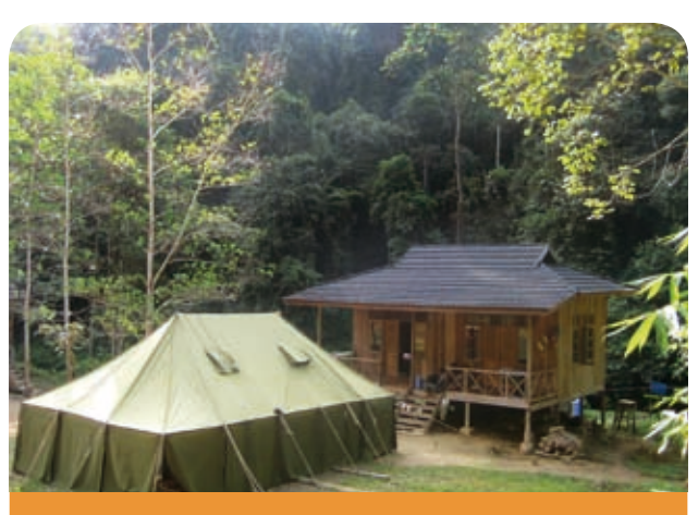
At the Perth Zoo funded Orangutan Open Sanctuary in Sumatra, Indonesia.

Support for the conservation and protection of Sumatran Orangutan, Sumatran Elephant, Sumatran Tiger and other fauna in Bukit Tigapuluh National Park and surrounding areas in Sumatra, Indonesia, remained a key project