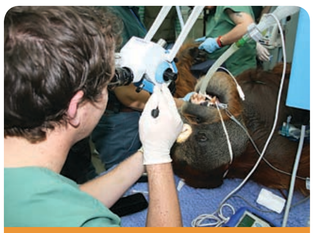
Male Sumatran Orangutan, Hsing Hsing, undergoing surgery.

The two human eye specialists, who donated their time and expertise, found that Hsing Hsing had glaucoma in his right eye, which was unrelated to his diabetes, and had lost up to 98 per cent of vision in that eye. With no way of restoring the sight, the eye was removed to