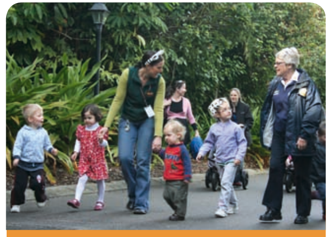
Participants in the 'A to Zoo' education program.